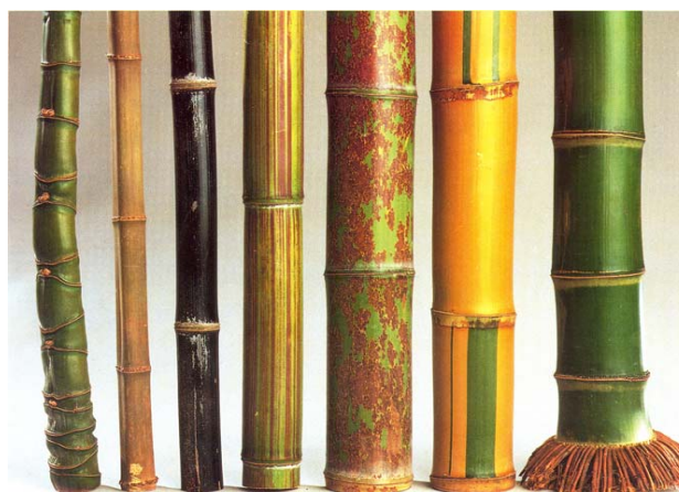
Fig. 1. Bamboo species of different colours.

As an engineering material, bamboo has a higher specific compressive strength than wood, brick or concrete and a specific tensile strength that rivals steel (Huang et al. 2018). However, it is biodegradable and susceptible to attack by fungi and especially by insects, particularly beetle and termites (Liese 1987). Bamboo durability depends on environmental and climatic conditions. Untreated bamboos have an average life of less than 3 years when exposed to either weathering elements and/or the soil. Under cover, they may be expected to last 4-7 years depending on the nature and conditions of use. This makes bamboo treatment of utmost concern especially when used as a structural material. An alternative to treatment is frequent replacement which may be time consuming. Treatment is necessary to increase the service life and improve the overall performance of bamboo products. Traditional methods of preserving bamboo include leaching, smoking and lime-washing. These methods generally do not require sophisticated technology and are usually cost-effective although not effective for long-term preservation. Chemical methods, on the other hand, involve the use of chemical preservatives which may be water-based, oil-based, organic solvent - based, or natural toxicants to protect bamboo from degradation. The chemicals have a more lasting effect and therefore increase the service life of bamboo products (Gnanaharan and Mohanan 2002).