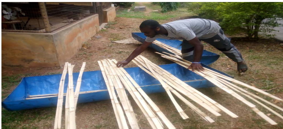
Fig. 2. Bamboo strips laid out for sun-drying.