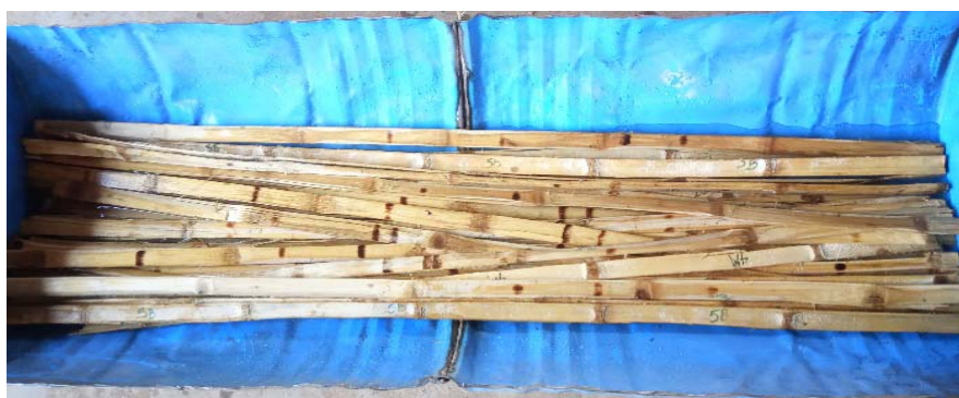
Fig. 3. Soaking the bamboo strips in boric: borax solution.

After dilution, the bamboo strips were soaked in the boric acid: borax solution in an improvised tank for 72 hours (Fig. 3) and air-dried.